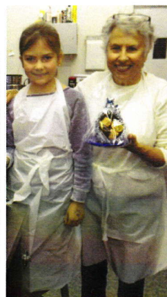
We made "Chanukacopias"